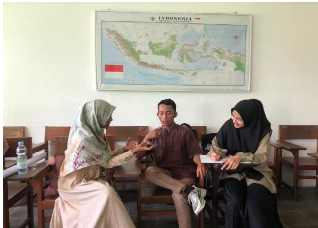
Figure 1. Group photo activity after interviewing one of the PAI students.

The views of Islamic Religious Education students on humanist literacy are expressed in various opinions according to their respective understandings. The first opinion is explained that humanist literacy is created based on events related to social problems in society. Indonesia is a country that has diverse citizens, be it ethnic, cultural, or even religious diversity, therefore it is prone to problems related to social relations among the diversity of society in Indonesia. With the awareness of humanist literacy, ideas are created to answer the resolution of problems that occur which are then expressed in writing.